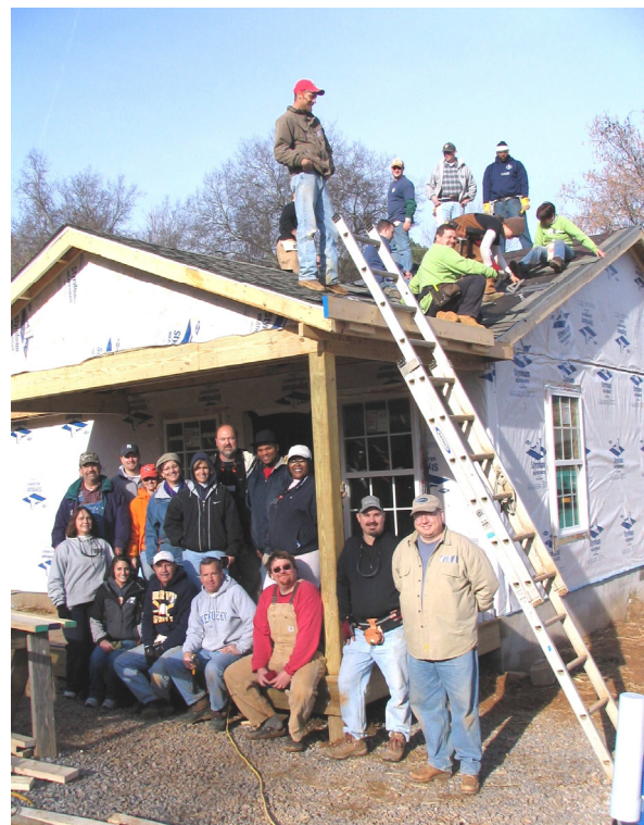
Greater Tennessee Chapter volunteers constructed the roof of the Habitat House on December 13th, 2008, the first of their three scheduled work dates.